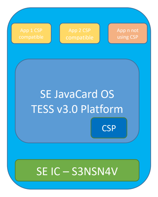
Figure 1: TESS v3.0 CSP architecture

The high-level architecture of the TESS v3.0 CSP can be represented as follows: