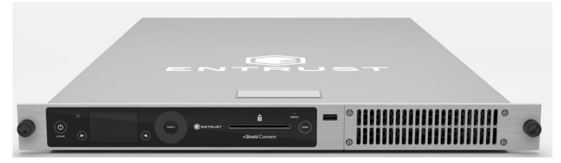
Figure 2 nShield Connect XC