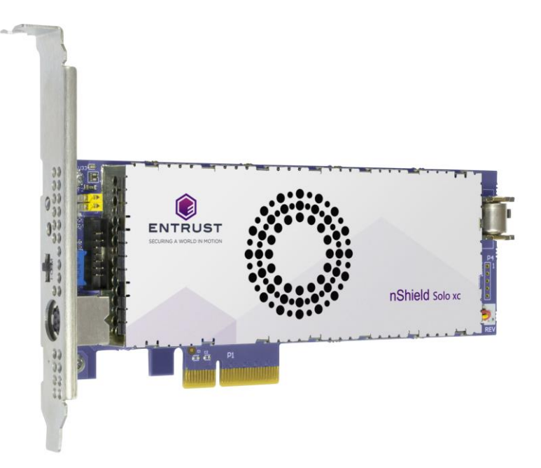
Figure 1 nShield XC HSM